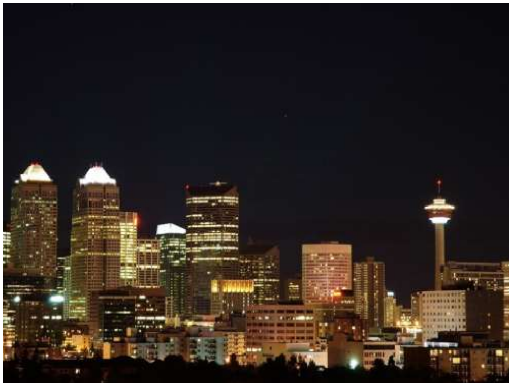
Calgary , the administrative and financial centre of Canada's oil industry; the Provincial Institute of Technology and Art, Mount Royal College, the Allied Arts Centre, the Philharmonic Orchestra, the Jubilee Auditorium.