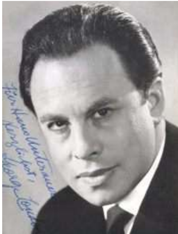
George London, a famous Canadian bass-baritone singer