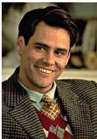
Jim Carrey The Mask («Маска», 1994) Dumb and Dumber («Тупой, еще тупее», 1994) Liar, Liar («Лжец, лжец», 1997) Bruce Almighty («Брюс всемогущий», 2003)