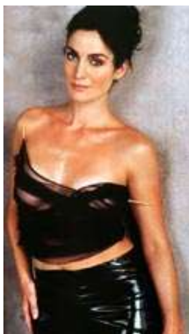
Carrie-Anne Moss Spider-Man («Человек-паук», 1994-1998) Matrix, The... Trinity («Матрица», 1999) Matrix, Reloaded («Матрица:Перезагрузка», 2003)