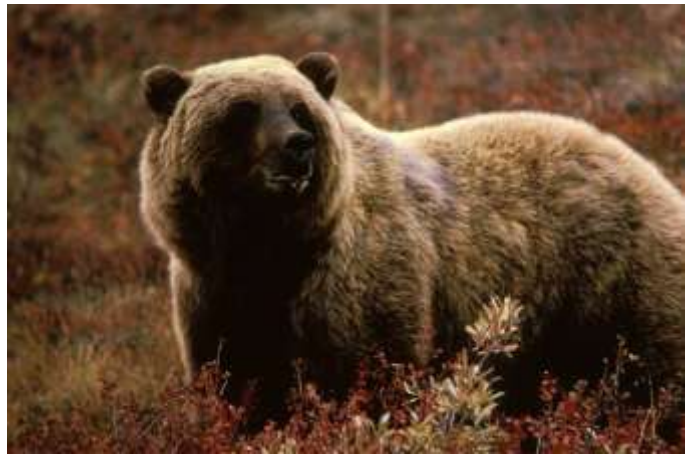
A grizzly bear

The Canadian birds are the American robin (дрозд), the black-capped chickadee (синица-черноголовка), the ruby-throated hummingbird (колибри), and the whooping crane (журавль).