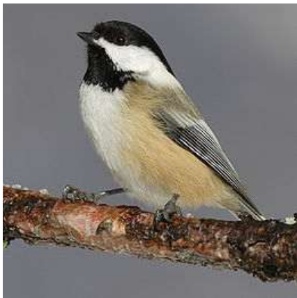
A black-capped chickadee

The Canadian birds are the American robin (дрозд), the black-capped chickadee (синица-черноголовка), the ruby-throated hummingbird (колибри), and the whooping crane (журавль).