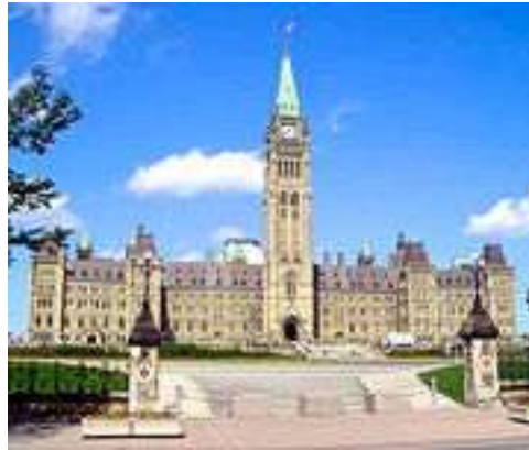
Parliament Hill, Ottawa