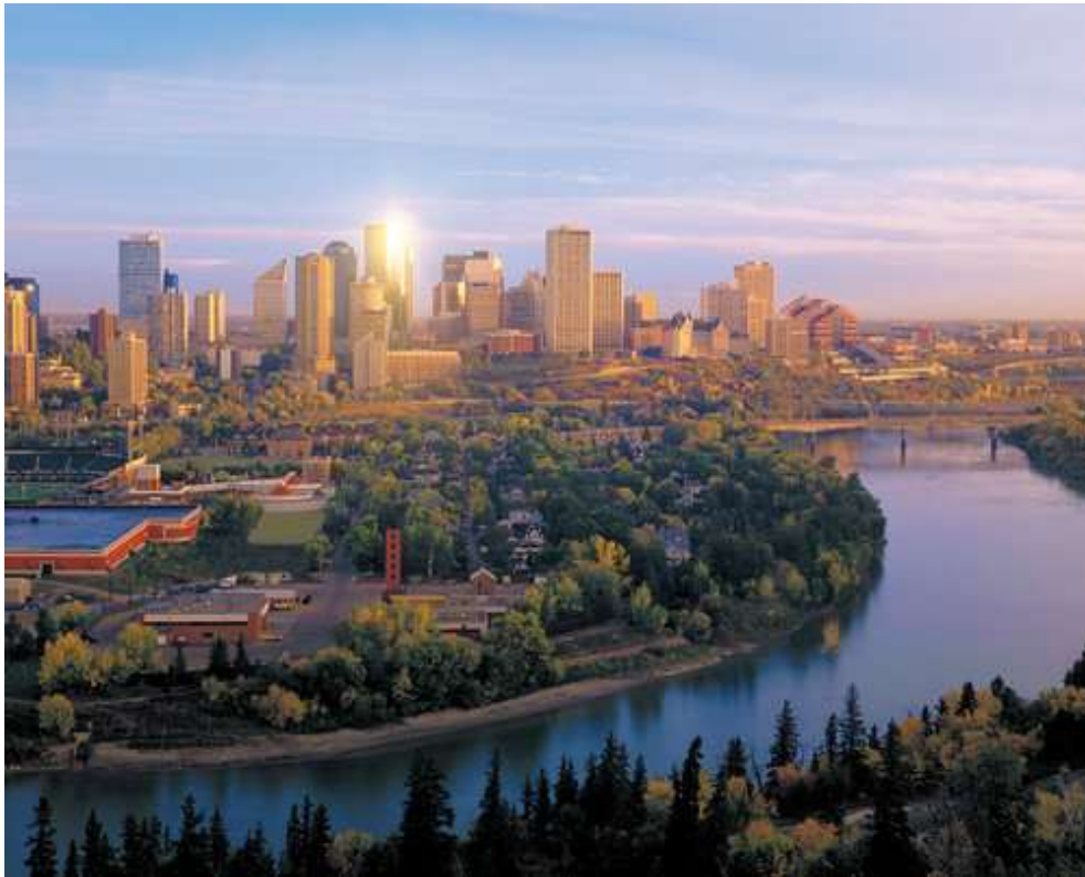
Edmonton , the capital of the province of Alberta; the University of Alberta.