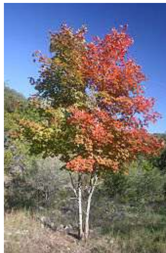
A maple tree

The maple leaf and the maple tree are the national flora symbols of Canada.