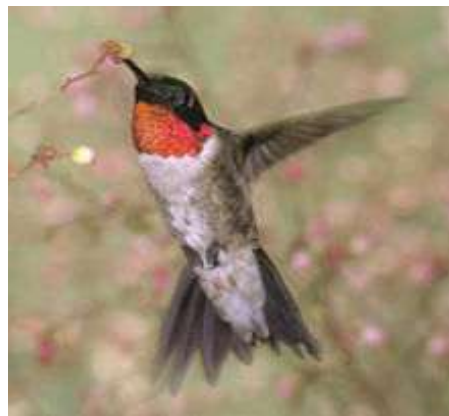
A ruby-throated hummingbird

In Canada, there are approximately 17,000 species of trees, flowers, herbs and other flora.